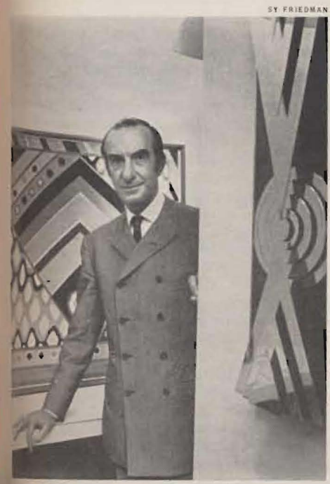
PUCCI & SILK-SCREENS Swathed in splinters and swirls.